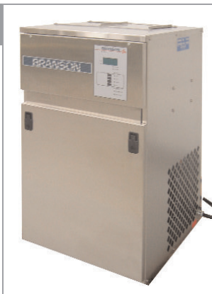
The small but powerful Branson B252R Vapor Degreaser integrates state-of-the-art controls with maintenance practicality in an ultrasonic vapor degreaser.