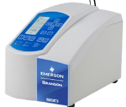
Model Shown SFX550

Flow-thru horn compatible with SFX250 and SFX550.